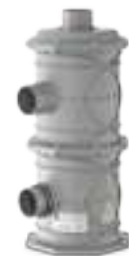
C-160541 HEPA H14 Filter 9-12 Surgeries Housing not included