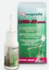
M-040727 Lubri-Jet Lubricant Drops