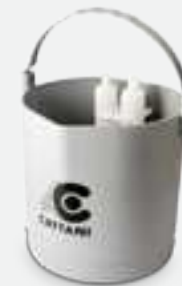
C-040720 Pulse Cleaner Automatic Dispenser