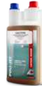
M-060970 Puli-Jet GENTLE Disinfectant Solution

Please don't place this item in the rubbish bin and/or down the sink.