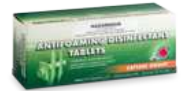
M-140825 Antifoaming Disinfectant Tablets