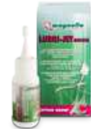
M-040727 Lubri-Jet Lubricant Drops