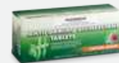
M-140825 Antifoaming Disinfectant Tablets