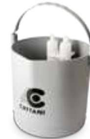
C-040720 Pulse Cleaner Automatic Dispenser