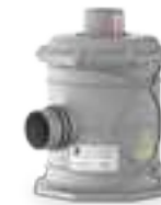
C-160540 HEPA H14 Filter 4-6 Surgeries Housing not included

Contact your equipment service technician or Cattani if you require any further information.