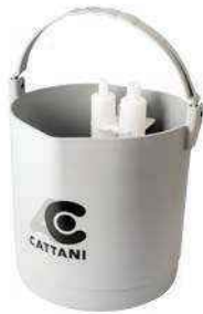
C-040720 Pulse Cleaner Automatic Dispenser