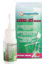
M-040727 Lubri-Jet Lubricant Drops