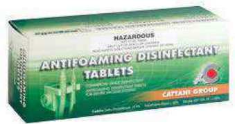
M-040825 Antifoaming Disinfectant Tablets