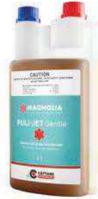
M-060970 Puli-Jet GENTLE Disinfectant Solution